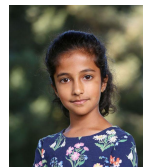
Ravens (Grade 4)