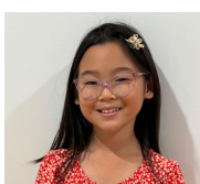
Ravens (Grade 4)