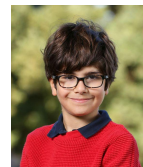
Ravens (Grade 4)