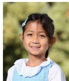
Ravens (Grade 4)