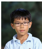
Ravens (Grade 4)