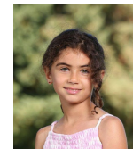
Ravens (Grade 3)