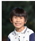
Ravens (Grade 4)