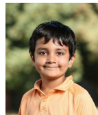
Ravens (Grade 3)