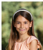
Ravens (Grade 3)