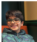
Ravens (Grade 4)