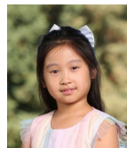
Ravens (Grade 4)