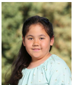
Ravens (Grade 3)