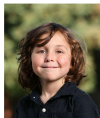
Ravens (Grade 3)