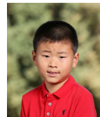
Ravens (Grade 3)