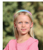
Ravens (Grade 3)