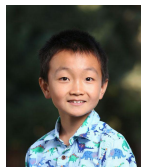
Ravens (Grade 4)