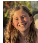
Ravens (Grade 3)