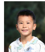
Ravens Grade 4