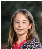
Ravens (Grade 4)