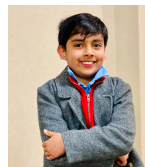
Ravens (Grade 3)