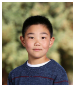
Ravens (Grade 3)