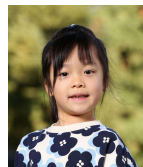
Falcons (Grade 1)