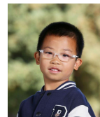
Falcons (Grade 1)