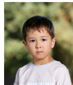
Falcons (Grade 2)