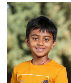
Falcons (Grade 2)