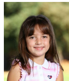
Falcons (Grade 2)