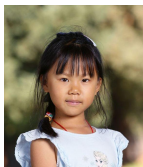
Falcons (Grade 2)