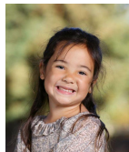
Falcons (Grade 1)