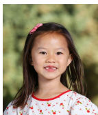
Falcons (Grade 1)