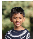
Falcons (Grade 2)