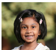
Falcons (Grade 1)