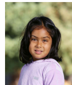
Falcons (Grade 1)