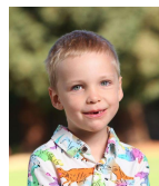
Falcons (Grade 1)