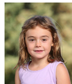
Falcons (Grade 2)