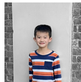
Falcons (Grade 2)