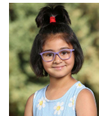
Falcons Grade 2