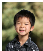
Falcons (Grade 2)