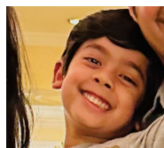
Falcons (Grade 2)