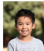
Falcons (Grade 2)