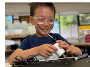
Falcons (Grade 1)