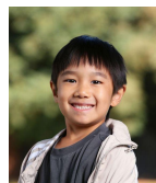
Falcons (Grade 1)