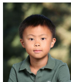
Condors (Grade 5)