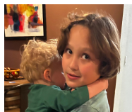
Condors (Grade 6)