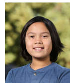
Condors (Grade 6)