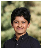
Condors (Grade 6)