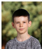
Condors (Grade 6)