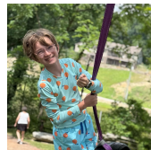
Condors (Grade 5)