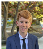
Condors (Grade 5)