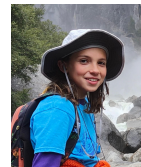
Condors (Grade 6)