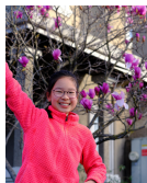
Condors (Grade 6)