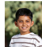
Condors Grade 6