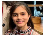
Condors (Grade 5)