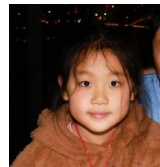
Condors (Grade 6)