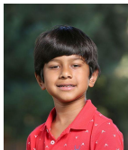
Condors (Grade 5)