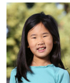
Condors (Grade 5)