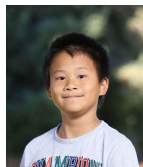
Condors (Grade 5)