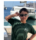
Condors (Grade 5)