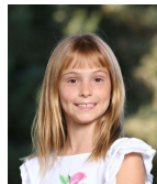
Condors (Grade 5)