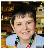
Condors (Grade 6)