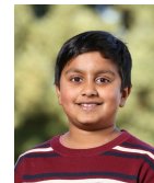
Condors (Grade 6)